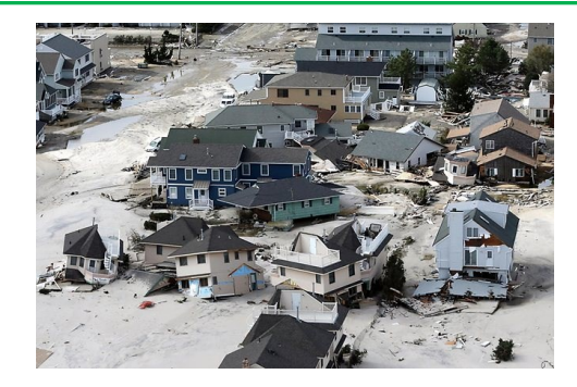
Aftermath of Superstorm Sandy

Angie's List (October 2013) interviewed their members who had lived through the natural disasters in the headlines of 2012 and 2013. Survivors of superstorm Sandy, the wildfires of Colorado Springs, and the EF-5 tornado in Oklahoma City, shared the lessons they learned from the traumatic event of losing a home.