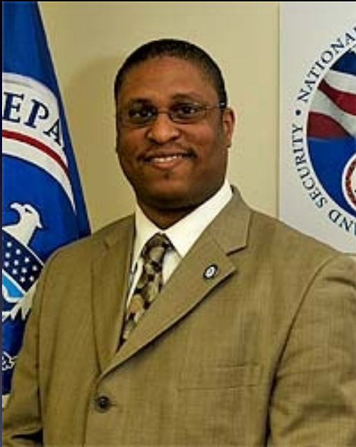
Emergency Management Coordinator